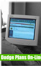
Dodge Plans On-Line