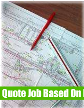
Quote Job Based On Plans